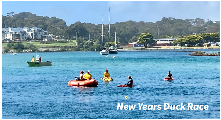
New Years Duck Race