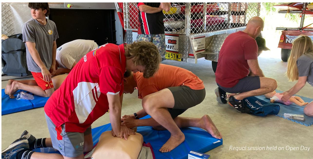
Requal session held on Open Day