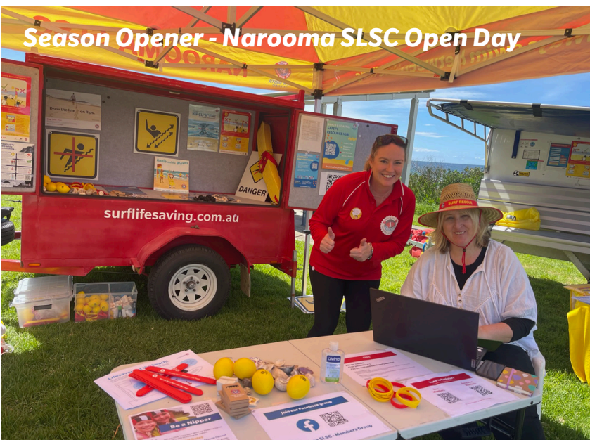
Season Opener - Narooma SLSC Open Day