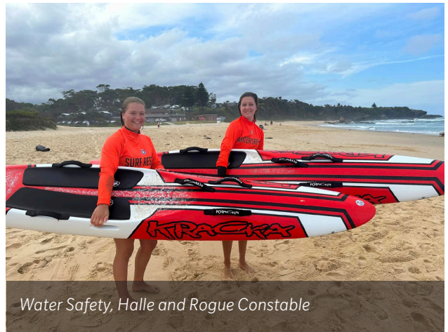
Water Safety, Halle and Rogue Constable