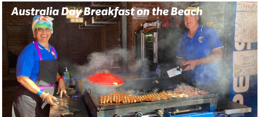
Australia Day Breakfast on the Beach