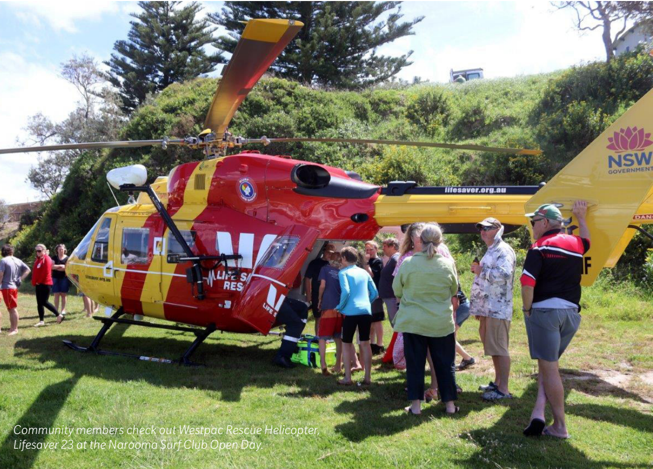
Community members check out Westpac Rescue Helicopter, Lifesaver 23 at the Narooma Surf Club Open Day.