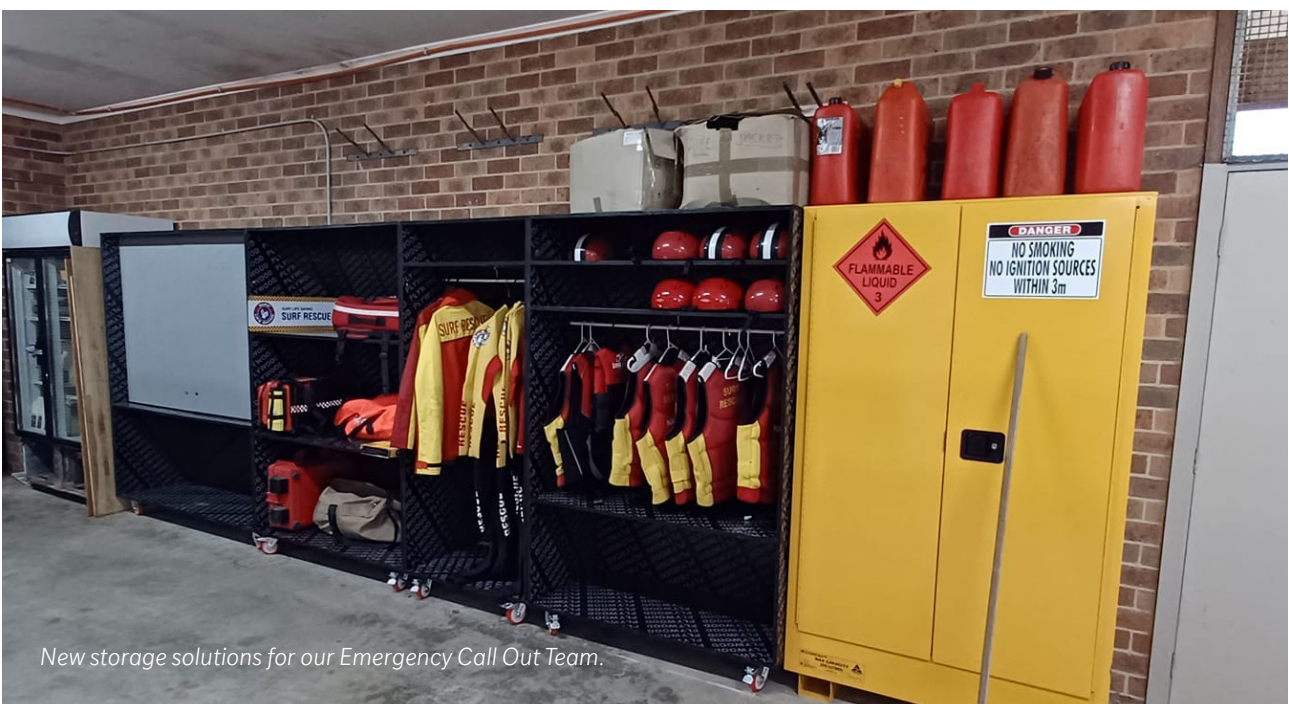
New storage solutions for our Emergency Call Out Team.