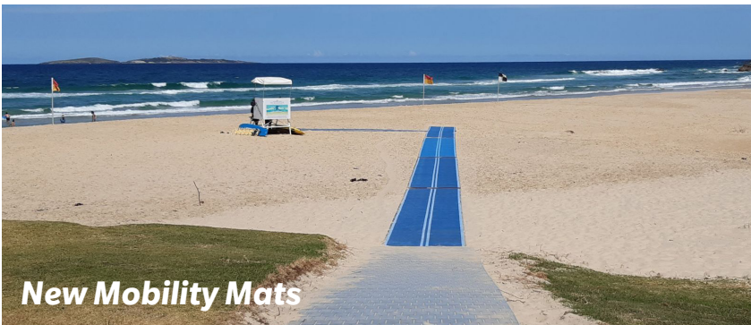
New Mobility Mats