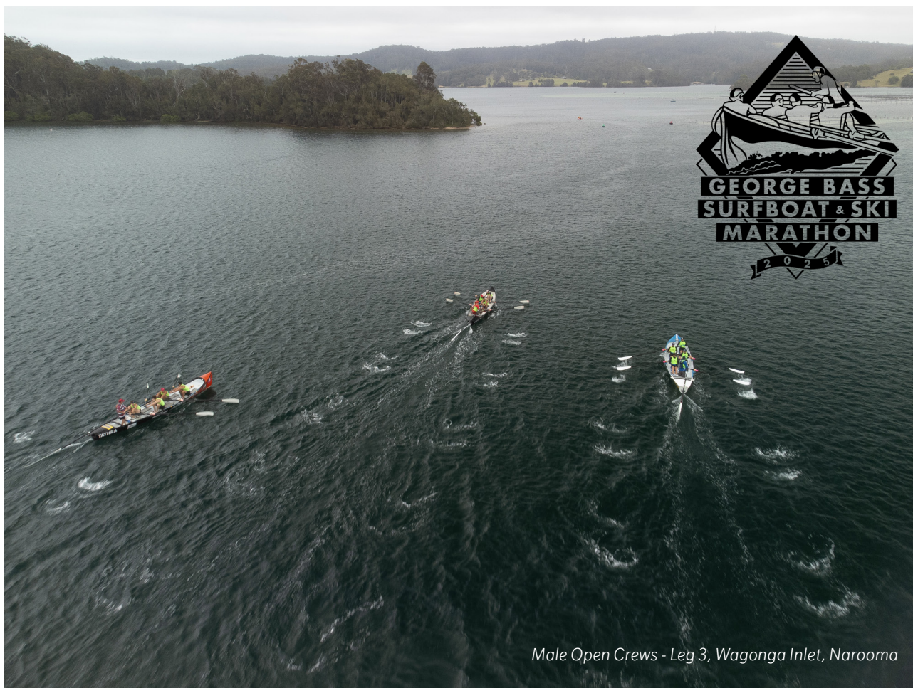
Male Open Crews - Leg 3, Wagonga Inlet, Narooma