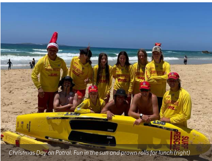
Christmas Day on Patrol. Fun in the sun and prawn rolls for lunch (right)