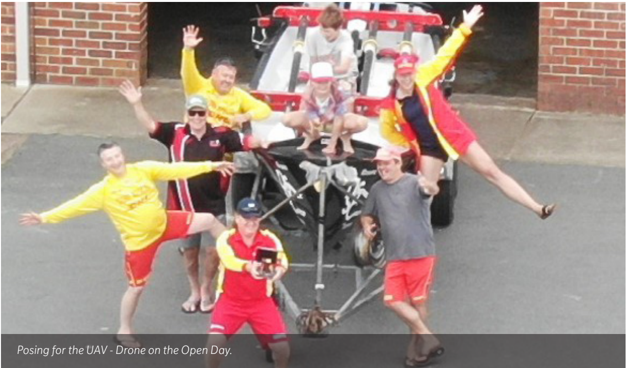
Posing for the UAV - Drone on the Open Day.