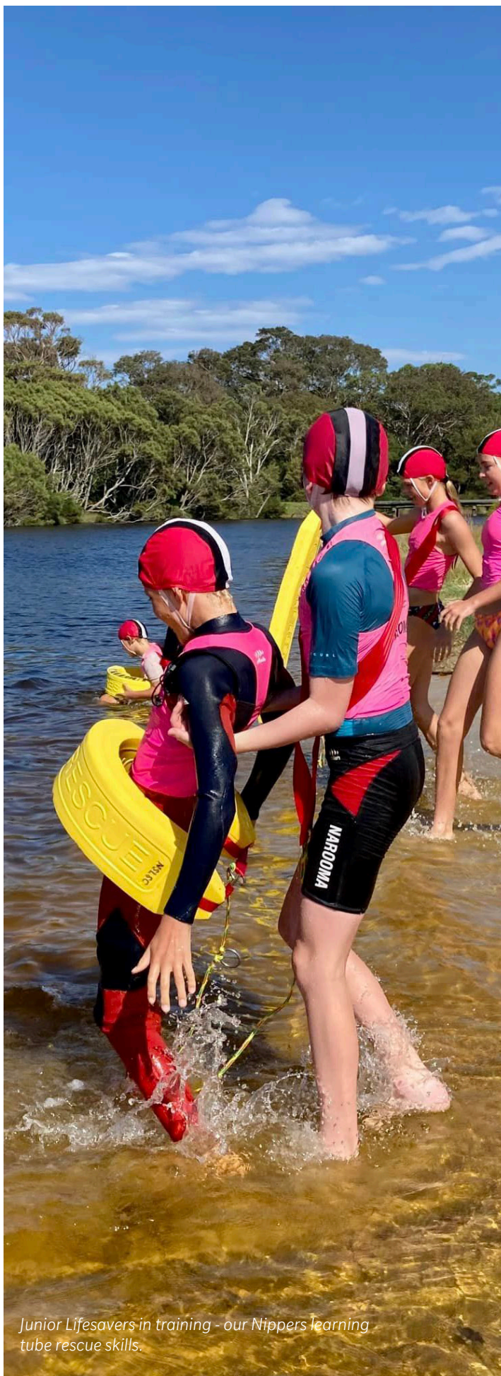
Junior Lifesavers in training - our Nippers learning tube rescue skills.