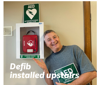
Defib installed upstairs